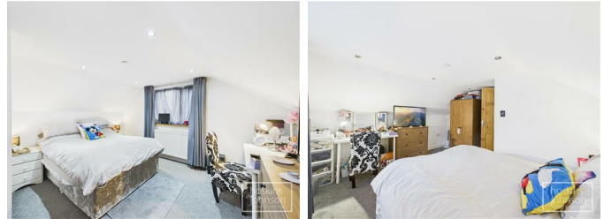
Double glazed window to side, radiator, ceiling spotlights.