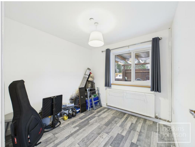
Double glazed windows to front and side, radiator, laminated wood flooring.