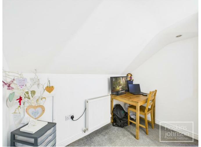
Radiator, space for desk and chair.