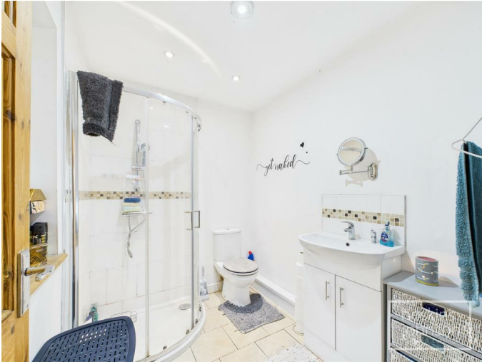
Tiled shower cubicle, wc, wash hand basin, tiled floor, chrome heated towel rail, ceiling spotlights, double glazed window to front.