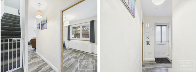
Half glazed entrance door.