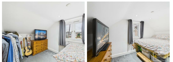
Double glazed window to side, radiator.