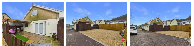
Gravelled parking area to side. Paved side and rear gardens.